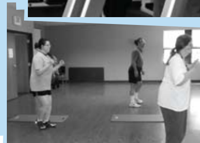
Members work out at Northfield Park District Fitness Center